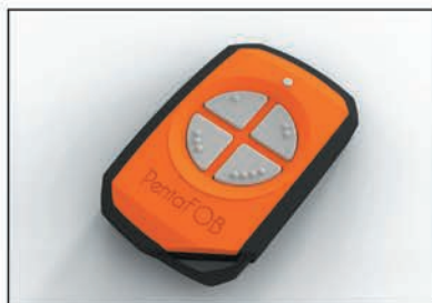
Case Black Upper Orange

The PentaFOB® is an extremely versatile remote control that can be customized through a range of configurations and colours to suit your needs.