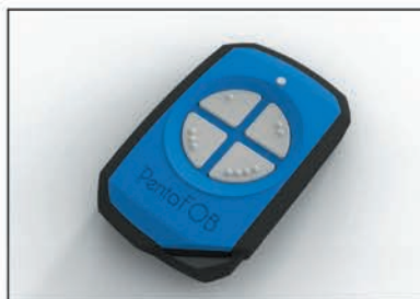
Case Black Upper Blue