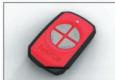
Case Black Upper Red

Choose from a range of colour options. Mix and match! If you require a custom Pantone® colour please contact us for more information